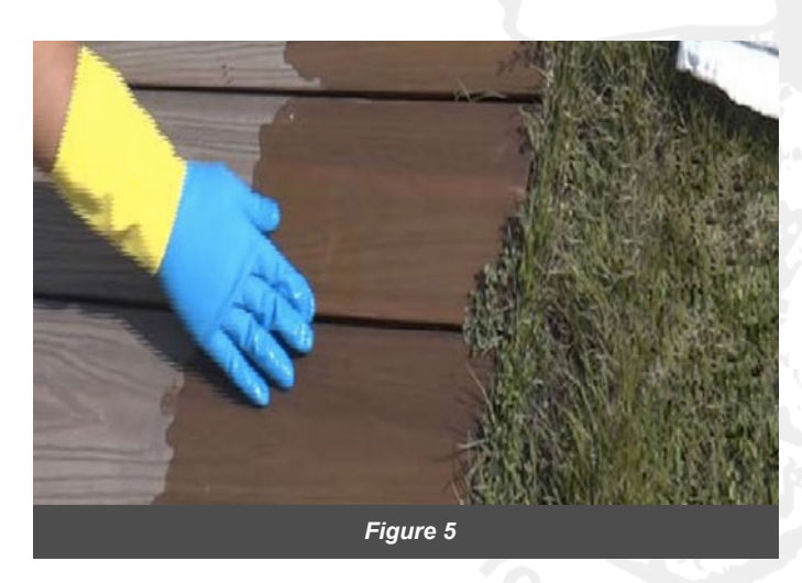
4. After applying the mixture, leave it on the deck for at least 5 minutes to let the mixture soak into the mineral deposit, it makes cleaning much easier.

5. After allowing the mixture to sit for at least 5 minutes, take the soft bristle brush and begin to scrub in the direction of the grain. The strength