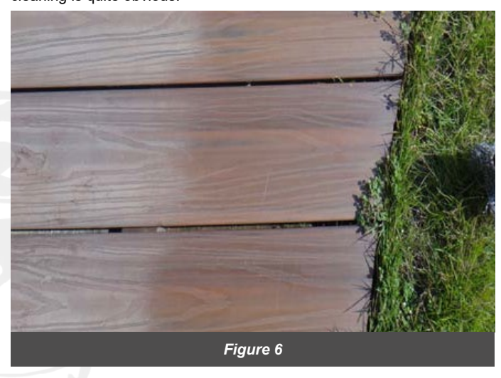
Note: It might take multiple times to scrub the board in order to get the mineral deposit off the surface. Also, quicker results may be seen if you continuously scrub while adding the mixture on the effected area.