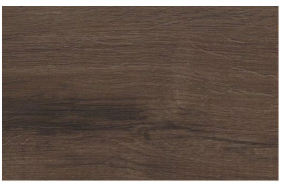
Torino Oak Bruno 1127816