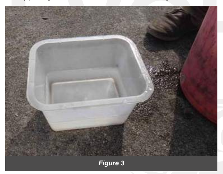
2. Then, we will add the same amount of vinegar to that bucket as shown in Figure 4.

1. First, we will need to make a 50/50 mixture of vinegar / water. We will start by pouring water into a bucket first as shown in Figure 3.