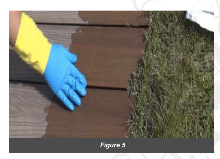
4. After applying the mixture, leave it on the deck for at least 5 minutes to let the mixture soak into the mineral deposit, it makes cleaning much easier.

5. After allowing the mixture to sit for at least 5 minutes, take the soft bristle brush and begin to scrub in the direction of the grain. The strength