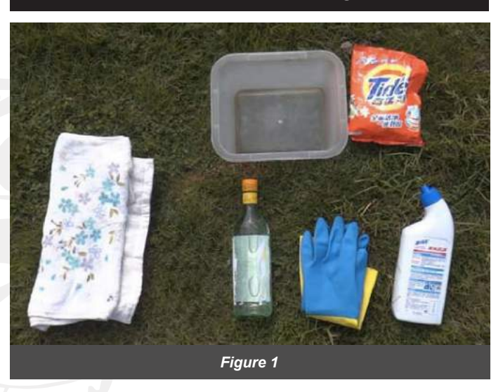
In Figure 1, you can see the cleaners and materials that you will need to clean up the mineral deposits.