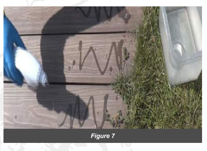
2. Then, pour water over the effected boards and rub together with the toilet bowl cleaner and water. Allow it to sit on the boards for at least 5 minutes as shown in Figure 8.

Take the toilet bowl cleaner and apply it on each effected board as shown in Figure 7.