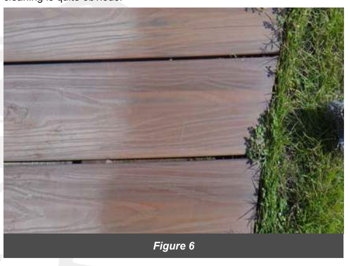
Note: It might take multiple times to scrub the board in order to get the mineral deposit off the surface. Also, quicker results may be seen if you continuously scrub while adding the mixture on the effected area.